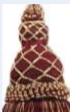
PE – 71/46