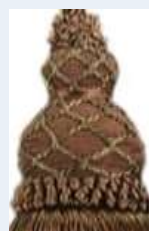
PE – 16/35