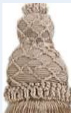
PE - 3