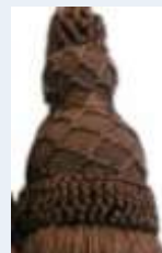
PE – 18