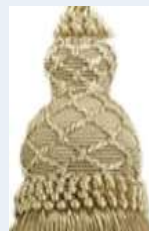
PE - 5