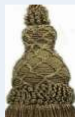
PE – 36/35